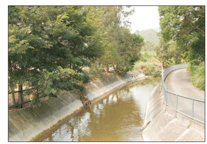
Channel at Tsung Yuen Ha