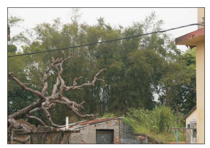
Fung Shui Woodland near Kan Tau Wai