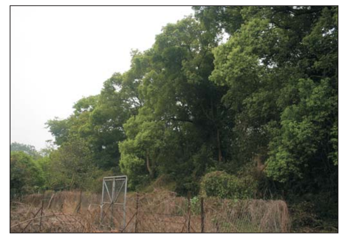
Fung Shui Woodland near Tsung Yuen Ha