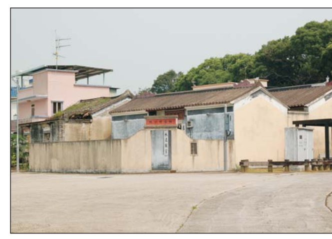
Developed Area at Tsung Yuen Ha