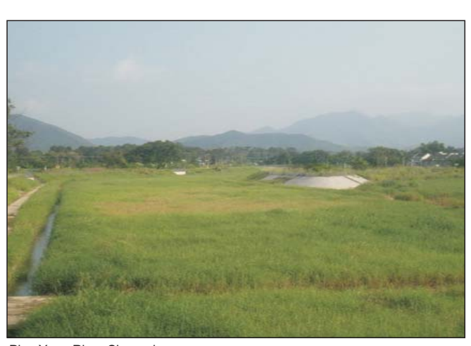
Ping Yuen River Channel