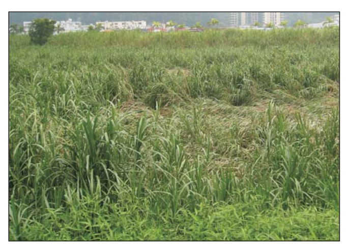
Low-lying Grassland and Marshy Low-lying Grassland at the far end